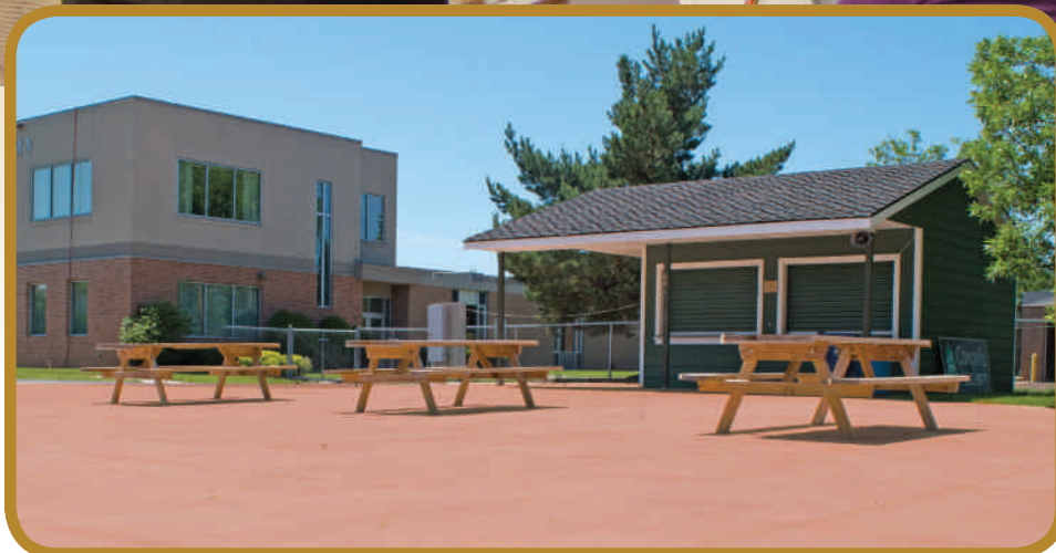
Pictured is the new Carlander and Koepke Family Alumni Plaza